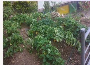
"Photos of the Club's accomplishments including two gardens and the produce developed from them."