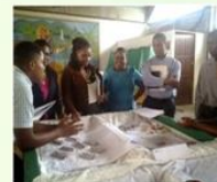
Items from the "Make something to Sell" initiative

The NDFD's involvement and advocacy has made a significant difference to students across the island by driving home the message of financial literacy, prudence and skills diversification. A social investment in the total of $15,000 was donated to the Junior Achievement Dominica which is enlisted in different forms such as