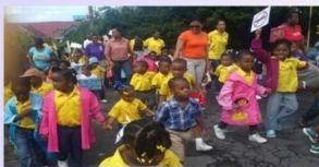
TC Sunbeam Students marching on Universal Children's Day

NDFD is an organization that treats you and your business idea with special care. They listen to you and try to get down to the nitty gritty aspects of the business to ensure that you receive the help you need I would encourage any small business person who has an idea but still needs some advice and maybe a hand to hold during the start up of the business. I would recommend anyone to go to NDFD for both financial and technical support.