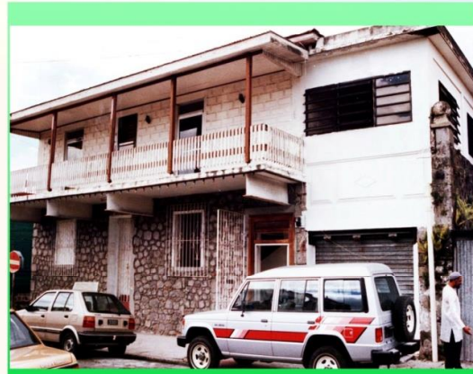
NDFD's 2nd location on Great Marlborough St.

The Foundation is administered by a voluntary Board of Directors consisting of 9 members with knowledge and experience in disciplines such as Finance, Agriculture, Banking and Credit, Gender Affairs, Business and Law, just to name a few. The day to day management is the responsibility of the Executive Director, assisted by a number of staff members all of whom are qualified in their respective areas of responsibility.