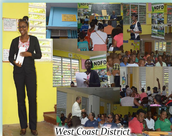
West Coast District